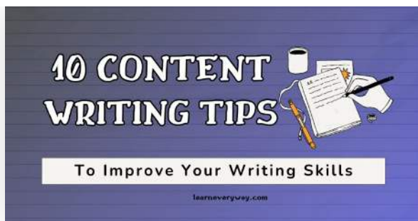
10 Content Writing Tips to Improve Your Writing Skills