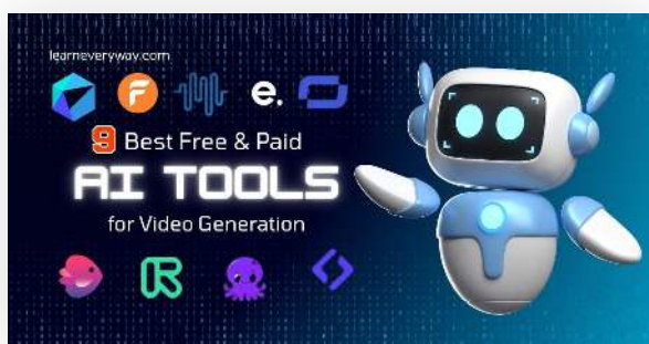
9 Best Free & Paid AI Video Generators