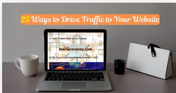
25 Ways to Drive Traffic to Your Website

Shopify is easier for beginners because everything is built-in and managed for you.