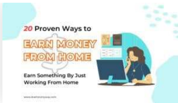
20 Proven Ways to Earn Money From Home