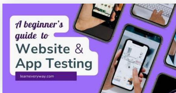
A Beginner's Guide to Website and App Testing