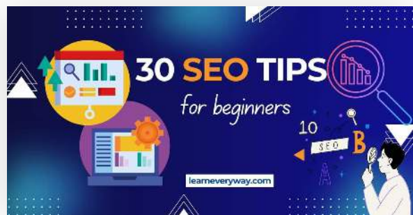
30 SEO Tips to Boost Your Website Rankings in 2025